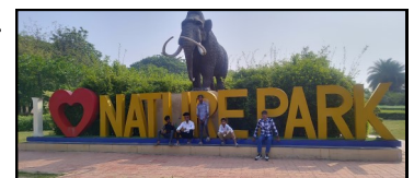
An adventure filled with practical learning at the cost of $30 per person.

When it was time to head back home, everyone had their heads and hearts filled with wonderful memories.