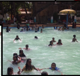
local 'Resort' and the crystal clear

water of the ASB school. I of course prefer the latter option but ... to the kids ... it doesn't matter. Water is Water and it is always GREAT!